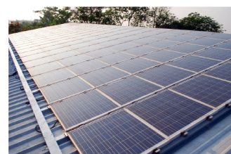
Installed Over 9000 Solar PV Projects - Utility Scale, Rooftop and Solar water pump