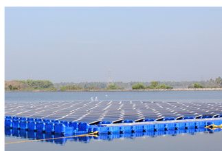
India's First Solar Floating Plant