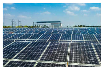
Installed Over 150 MW Solar PV Projects