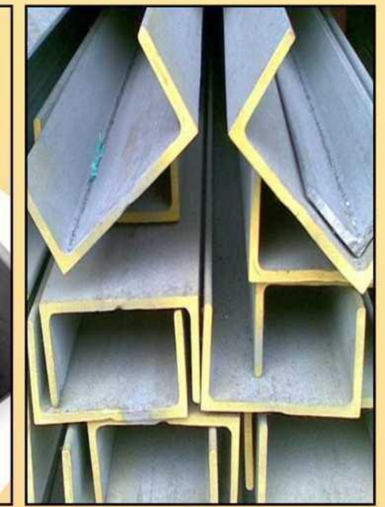
Re-Rolled Steel Structure