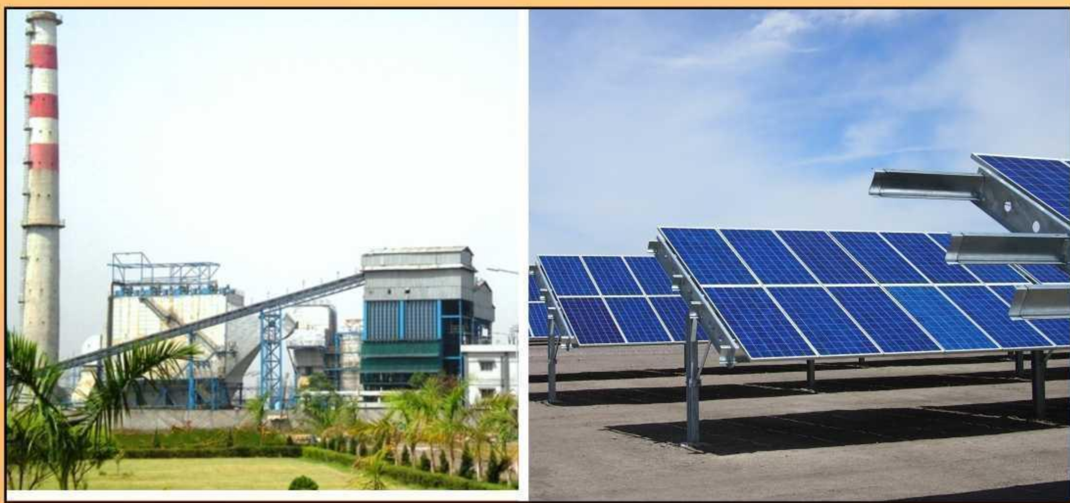
Thermal & Solar Power