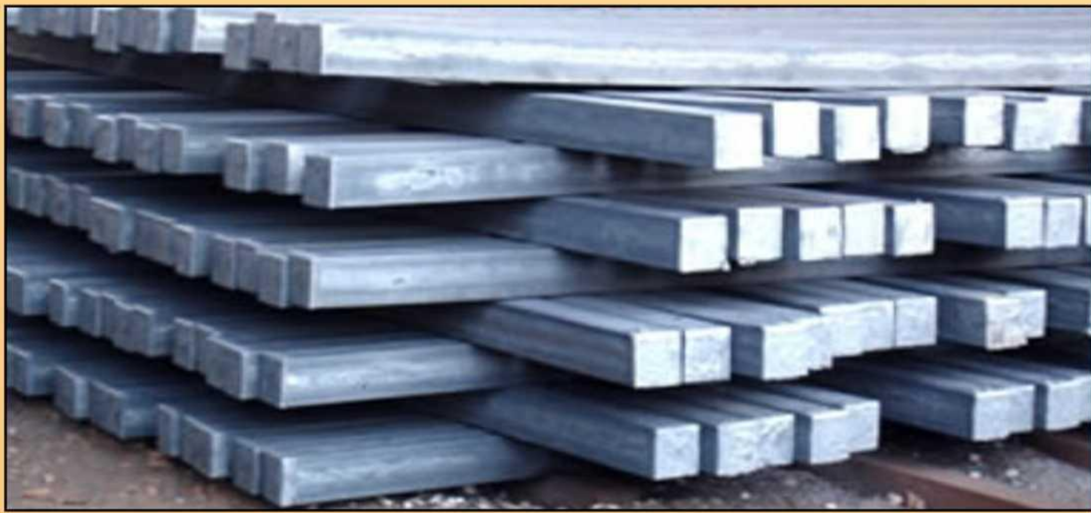
Billets / Blooms