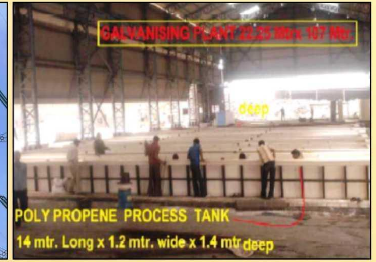
Fabricated & Galvanized Structure TLT Towers