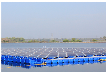
India's First Solar Floating Plant