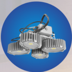
Process Area Lighting