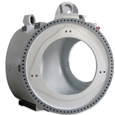
Λ HUB Wt - 11,500kgs