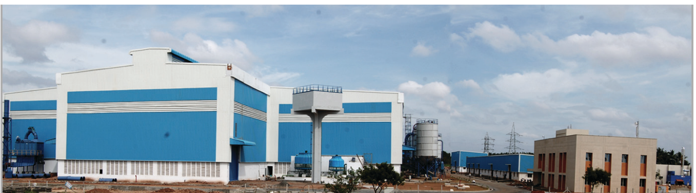
Λ Bradken Coimbatore, India Foundry

Chettipalayam - Palladam Road, Chettipalayam, Coimbatore - 641201, Tamil Nadu , India T +91 94422 42117 F +91 422 2588 500 E Rharishankar@bradken.com